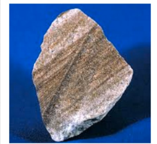
Sandstone: a sedimentary rock