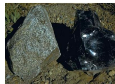
Basalt & Obsidian: igneous rocks