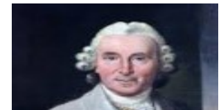
Significant figure : James Lind