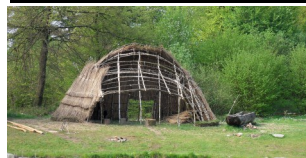
Stone age huts were built from natural materials