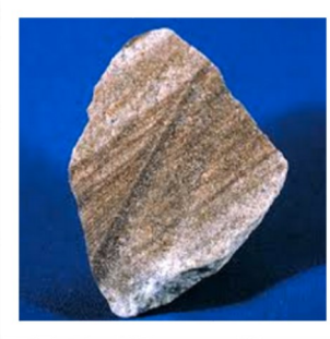
Gneiss: a metamorphic rock