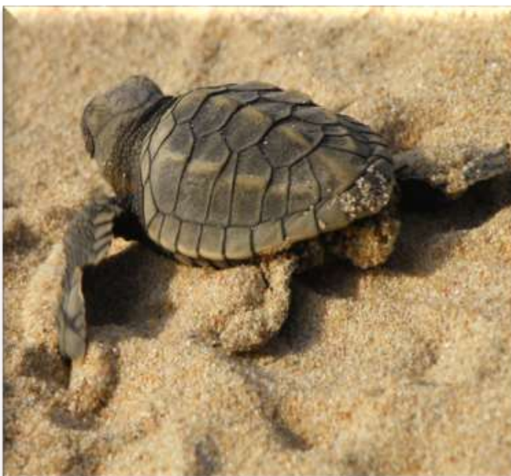
Pictured: Baby Olive Ridley turtle hatching