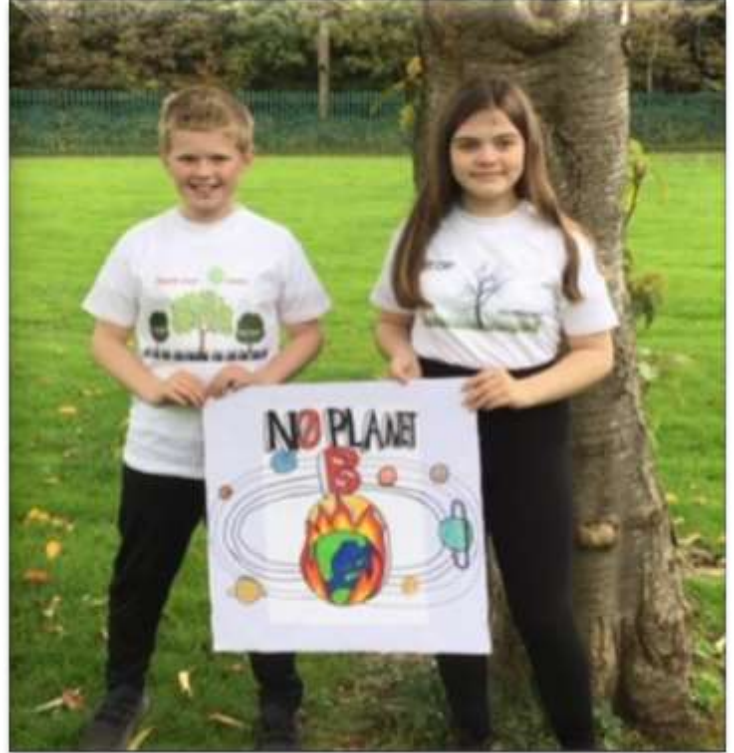
Pictured: Y6 Eco-warriors from Maryport School

A climate change project by Year 6 at Maryport CE Primary School in Cumbria has earned them a well-deserved Picture News Impact Award. The project began in September but when the children watched David Attenborough's film 'A Life on our Planet', they were totally shocked by the devastating impact that climate change has had on the natural world. As a result, they immediately got to work designing and making campaign t-shirts and producing persuasive placards. They then set off on a peaceful 'protest', demonstrating that it was the responsibility of young people to raise awareness of the need to protect our planet. Teachers at the school said: 'We are all incredibly proud of how they are all wanting to do their bit to save and protect the planet'. You can view the video they produced on our Picture News Facebook page.