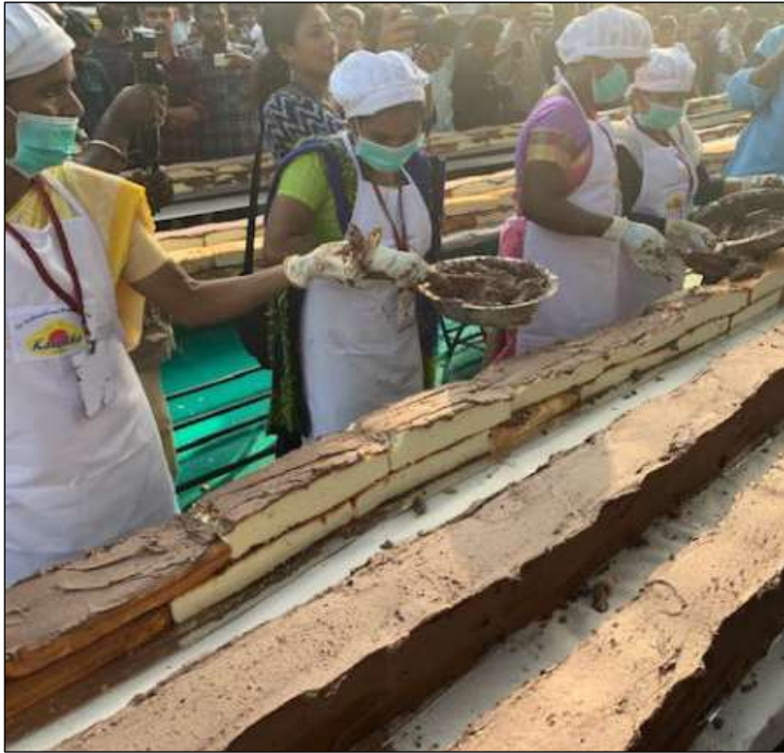
Pictured: Some of the many bakers icing the record-breaking cake taken from the Guinness World Records' Twitter page.

Guinness World Records, the global authority on record-breaking achievements since 1955, announced a new record for the world's longest cake! The record-breaking cake measured 5,300 metres and was created by around 1,500 bakers and chefs from the Bakers Association, Kerala (BAKE) in India. The gigantic vanilla cake with chocolate icing was 10cm wide and thick and weighed about 27,000kg. The cake, which took four hours to put together, was spread out across thousands of tables and desks set up across a festival ground and the adjacent roads in the city of Thrissur.