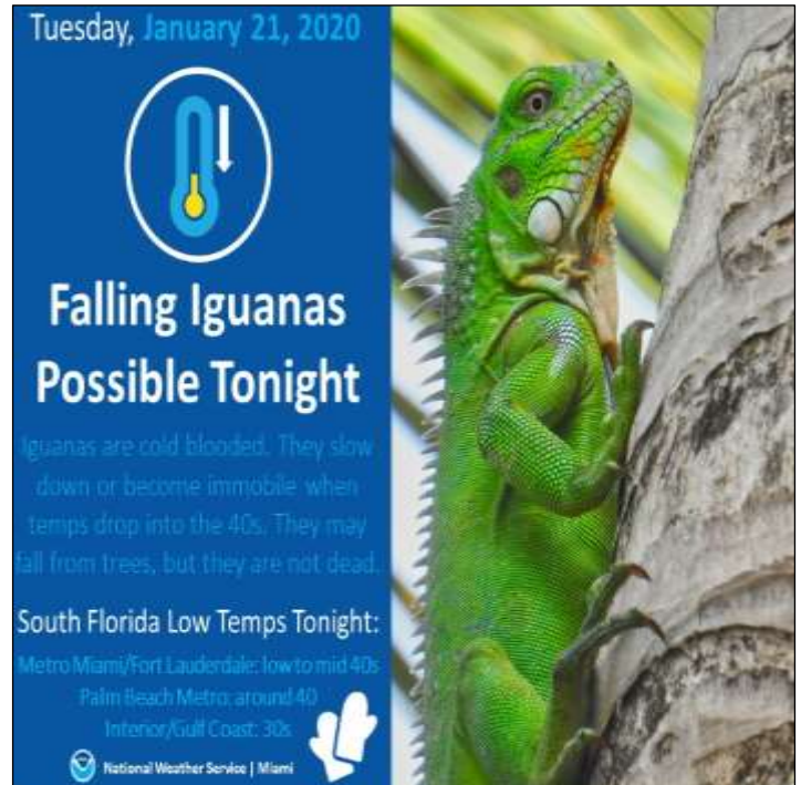
Pictured: The warning issued by the National Weather Service, Miami on their Twitter page.

Authorities in Florida have warned residents to watch out for a strange phenomenon during the unusual cold weather - frozen iguanas falling from trees. As iguanas are cold blooded, they have become so cold that they slow down or become entirely immobile and fall from the trees! Iguanas can grow up to 1.5m in length, and weigh as much as 9kg, making them very dangerous if they landed on passers-by. "This isn't something we usually forecast," the National Weather Service in Miami tweeted, "but don't be surprised if you see iguanas falling from the trees tonight as lows drop into the 30s and 40s. Brrrr." With the temperatures dropping to -1^{\circ}\text{C} overnight they reassured the public that iguanas would warm up, become able to move and scurry away to continue their day.