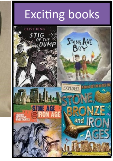
How tools changed over time